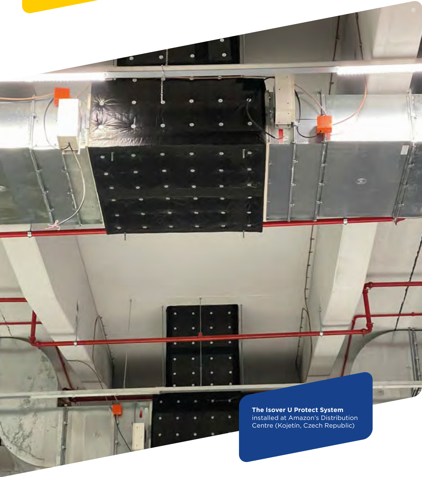
The Isover U Protect System installed at Amazon's Distribution Centre (Kojetin, Czech Republic)