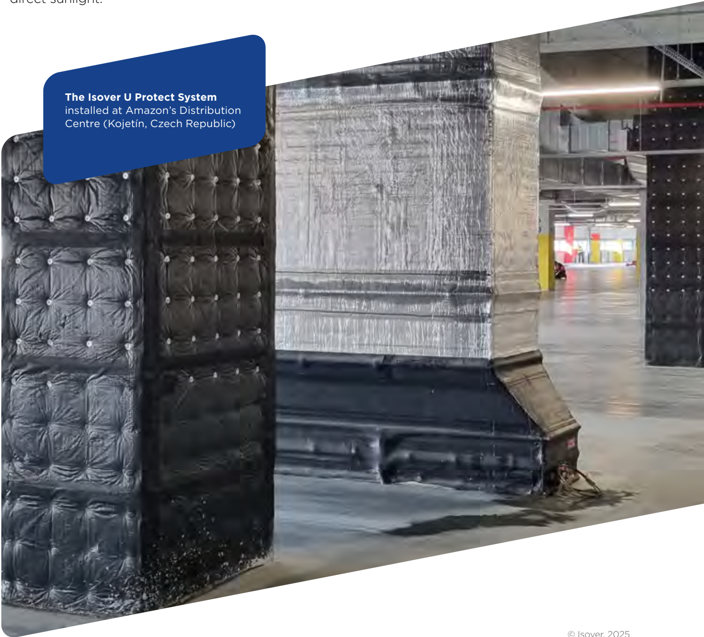
The Isover U Protect System installed at Amazon's Distribution Centre (Kojetín, Czech Republic)